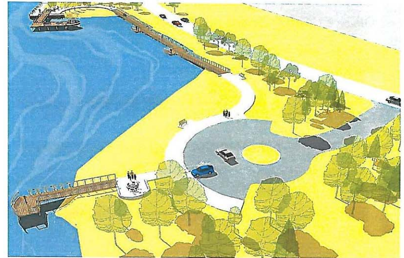
Artist rendering of completed Holland Harbor Fishing Access Courtesy of Cornelisse Design Associates